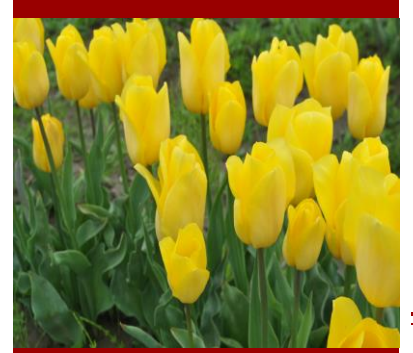
"Talent is always conscious of its own abundance and does not object to sharing." ~Aleksandr Solzhenitsyn