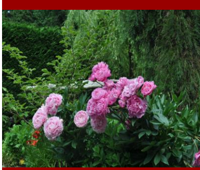
"'Three things cannot be long hidden: the sun, the moon, and the truth." ~Buddha